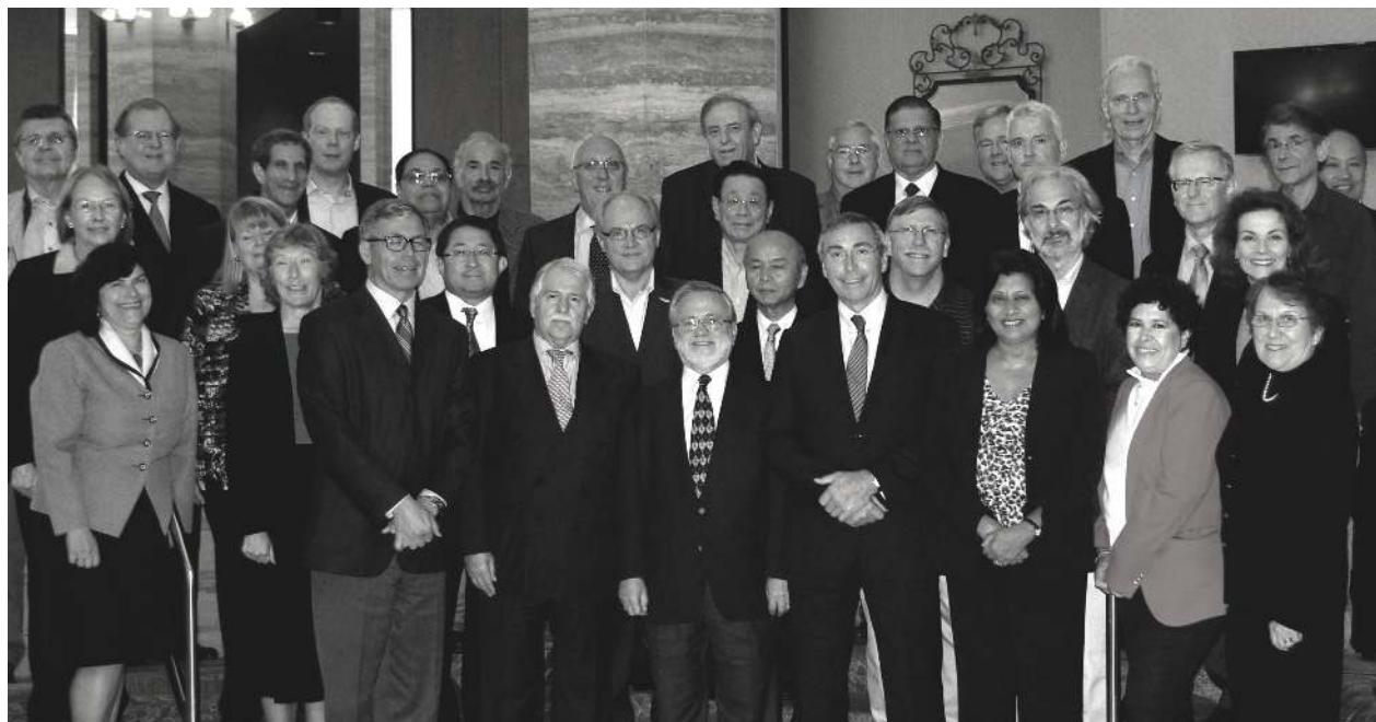
2013 ILSI Board of Trustees

These men and women take pride in their responsibility for determining ILSI's strategic goals, setting and enforcing organizational policies, and ensuring scientific integrity and financial transparency.