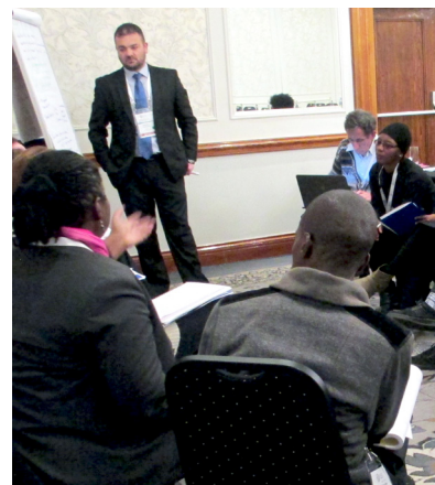
Participants share perspectives at ILSI South Africa's June 2014 workshop on food safety risk assessment.